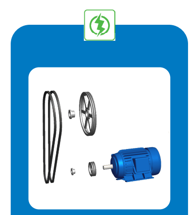
Oversized motor & Drive set