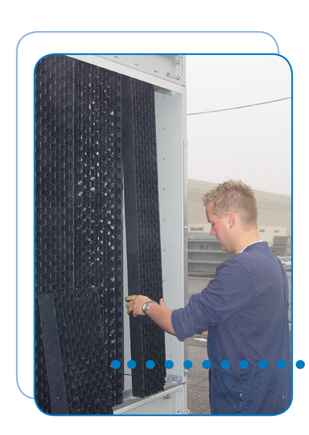
Easy to handle Combined Inlet Shields