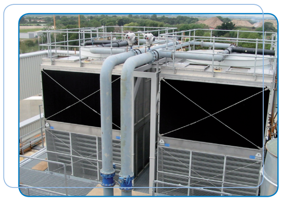
Combined Inlet Shields retrofitted to the top half of BAC S3000 cooling towers with old style louvres at the bottom