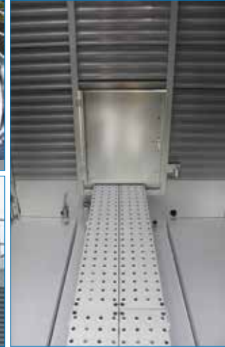
Inward swinging access door and internal walkway*