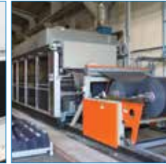
high quality manufacturing