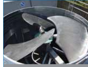
Whisper Quiet fan*