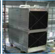
5000 m² R&D-test centre