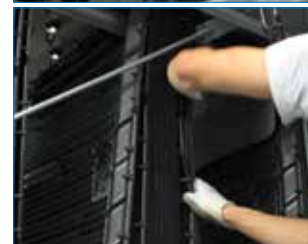
Patented BACross II fill for sheet by sheet inspection and cleaning