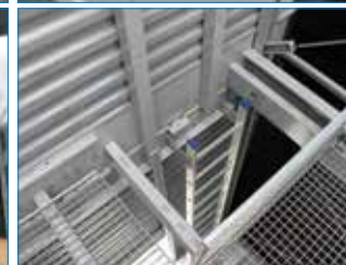
Internal service platforms*