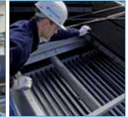
on site services

There is a wide variety of open cooling tower concepts available on the market. For this reason BAC recommends to evaluate different cooling tower configurations for your project. Your BAC Balticare representative is available to assist you in this evaluation.