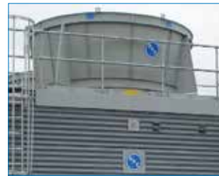
Velocity recovery stacks*