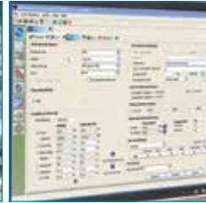
selection and simulation software